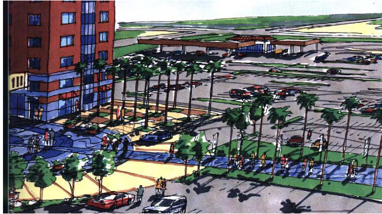
Figure 7 – B Tree rows are planned throughout the Imperial Center